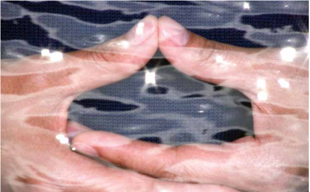
LIGHT (2015) BY MADELON HOOYKAAS. VIDEO STILL