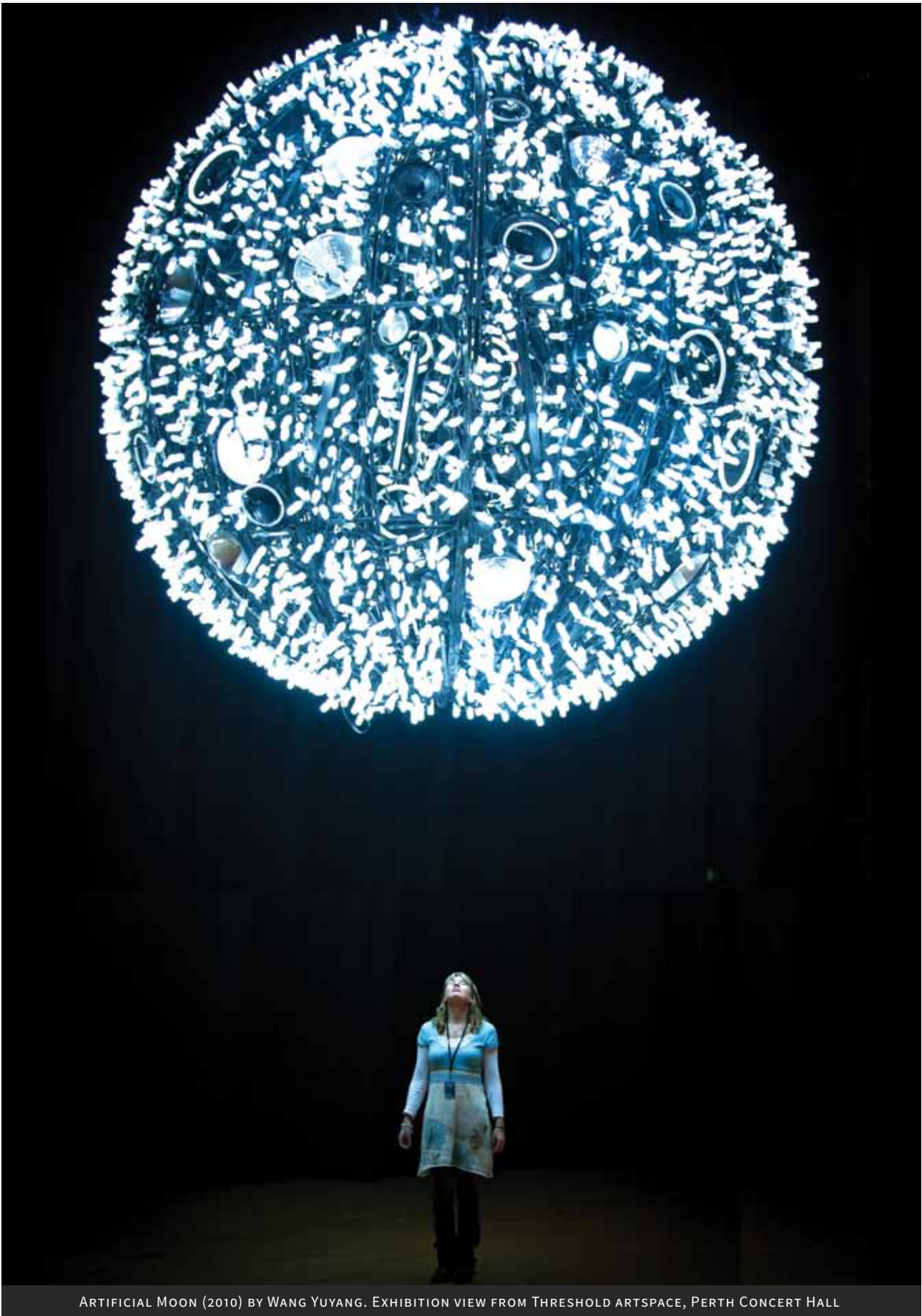
ARTIFICIAL MOON (2010) BY WANG YUYANG. EXHIBITION VIEW FROM THRESHOLD ARTSPACE, PERTH CONCERT HALL