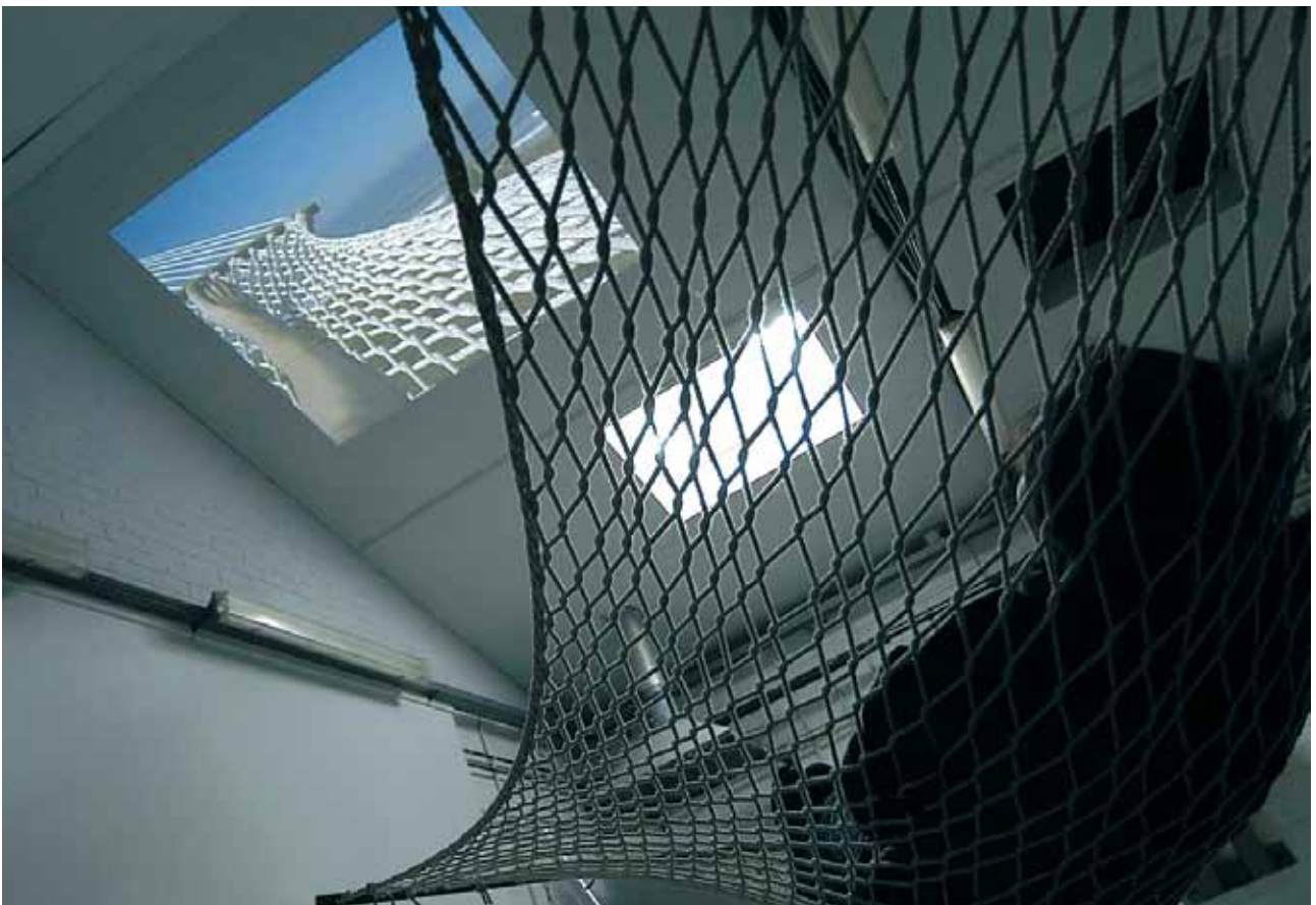
DAYDREAMING (2006) BY STANSFIELD/HOOYKAAS. EXHIBITION VIEW FROM AN OLD MILK FACTORY, KOLDERVEEN