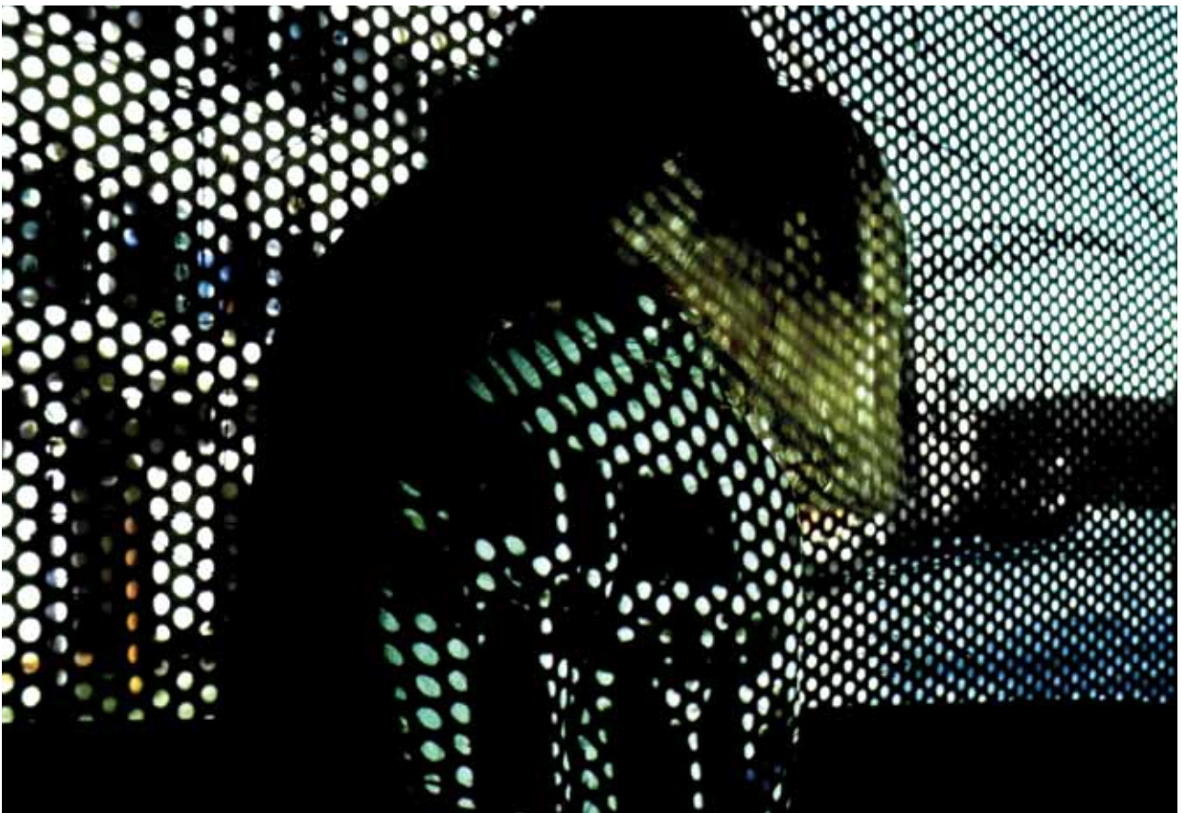
VIRTUAL WALLS | REAL WALLS I (2017) BY MADELON HOOYKAAS. EXHIBITION VIEW FROM PERFORMANCE AT EMILY HARVEY ARCHIVE, VENICE