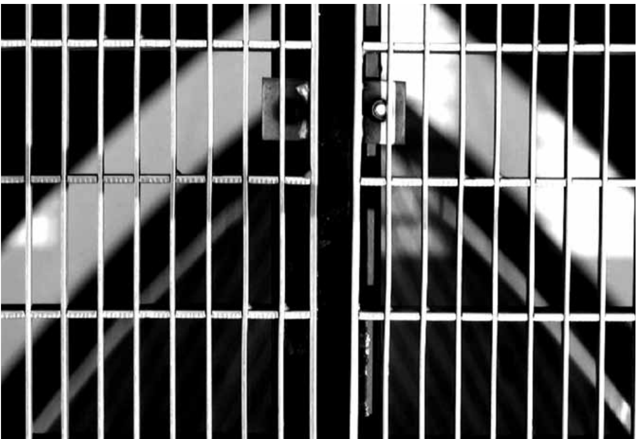
VIRTUAL WALLS | REAL WALLS II (2017) BY MADELON HOOYKAAS. VIDEO STILL