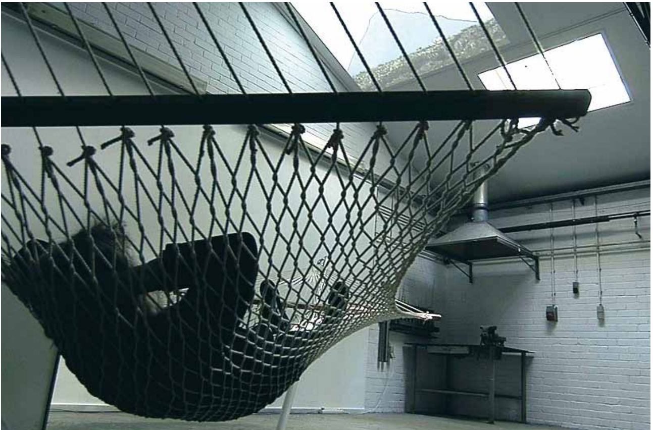
DAYDREAMING (2006) BY STANSFIELD/HOOYKAAS. EXHIBITION VIEW FROM AN OLD MILK FACTORY, KOLDERVEEN