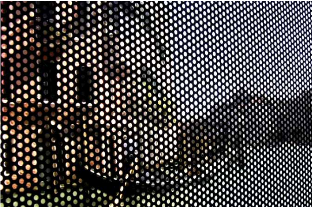
VIRTUAL WALLS | REAL WALLS I (2017) BY MADELON HOOYKAAS. VIDEO STILL