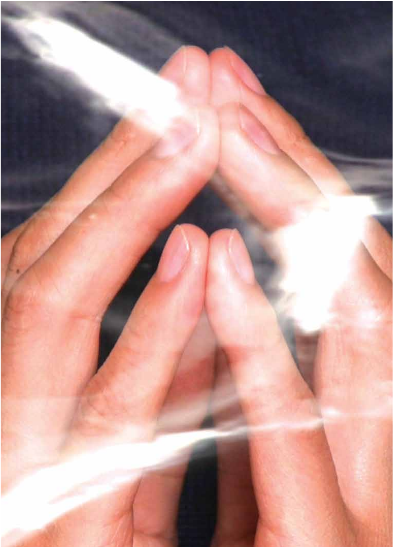
LIGHT (2015) BY MADELON HOOYKAAS. STILL FROM VIDEO